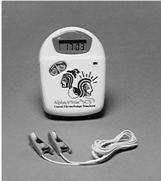
FIGURE 1: Cranial electrostimulation therapy (CES) device.

CES and the other half had no electric current flowing. Active devices provided subsensory stimulation of 100 microamperes. Active and sham devices were identical in appearance and were identified only with a serial number. Participants and the study coordinator were blinded to group assignment and the code sheet indicating which devices were active and which were sham was kept by another person who was not in contact with the participants. Participants in both the active and sham groups were taught how to use the device, provided with printed instruction sheets, and instructed to use the device 40 minutes daily for six weeks. They were provided with ear clip electrode pads, conducting solution with which to wet the pads, and 9-volt batteries.