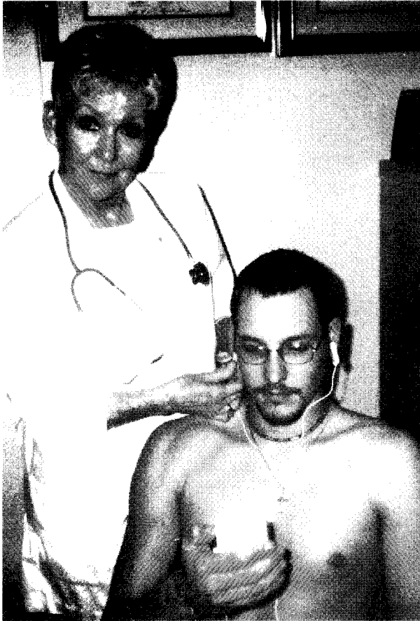
FIGURE 1 Showing how the CES electrodes are attached to the ear with ear clip electrodes

earlobes and as close to the cheek as possible. Figure 2 shows a typical use of the probe electrodes, which are placed so that the microcurrent will trace a direct path through the area of pain, between the electrodes. The probes are repositioned each 10 seconds following a beep from the device, but are always placed so that the current traces a direct path through the area of complaint or trauma.